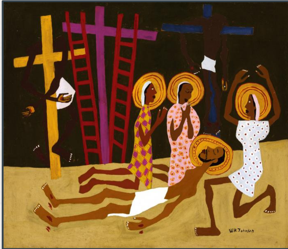
William H. Johnson Lamentation, ca. 1944

At noon, darkness came over the whole land until three in the afternoon.