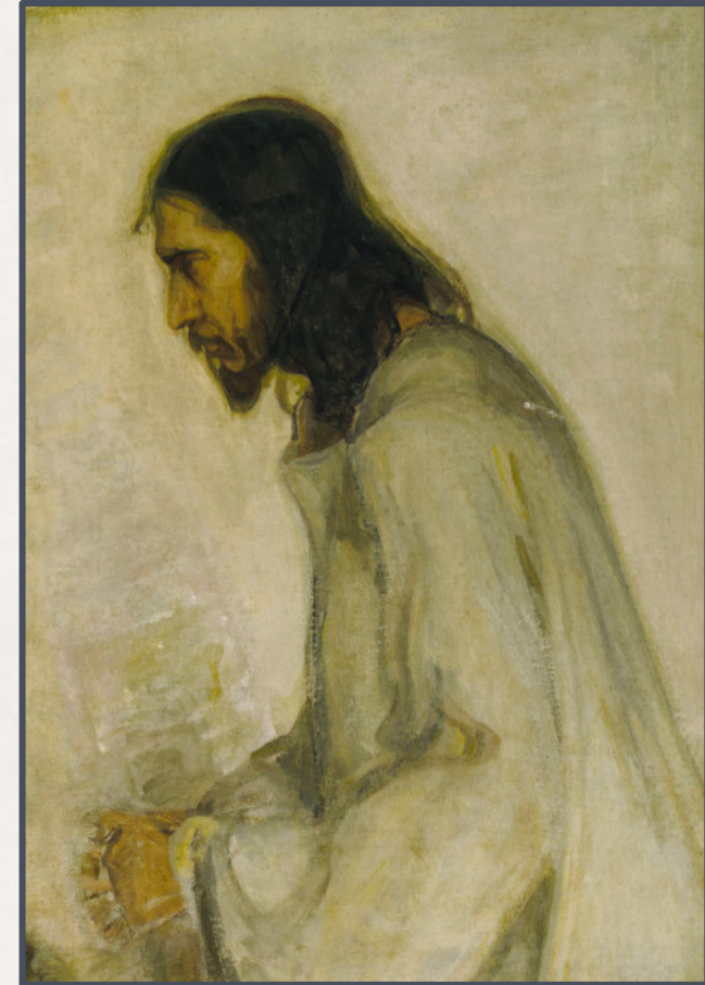
The Saviour Henry Ossawa Tanner